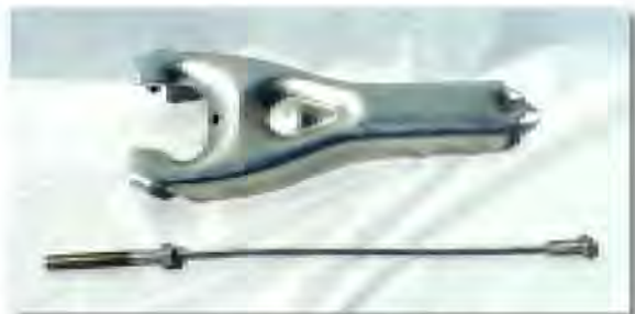
USING A JEEP ARM