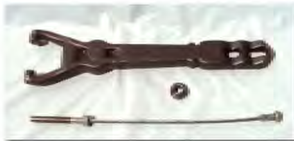
USING A GM ARM

SPECIAL NOTE: The components packaged in this kit have been assembled and machined for specific type of conversions. Modifications to any of the components will void any possible warranty or return privileges. If you do not fully understand modifications or changes that will be required to complete your conversion, we strongly recommend that you contact our sales department for more information. This instruction sheet is only to be used for the assembly of Advance Adapter components. We recommend that a service manual pertaining to your vehicle be obtained for specific torque values, wiring diagrams and other related equipment. These manuals are normally available at automotive dealerships and parts stores.